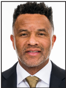
Damon Stoudamire Head Coach